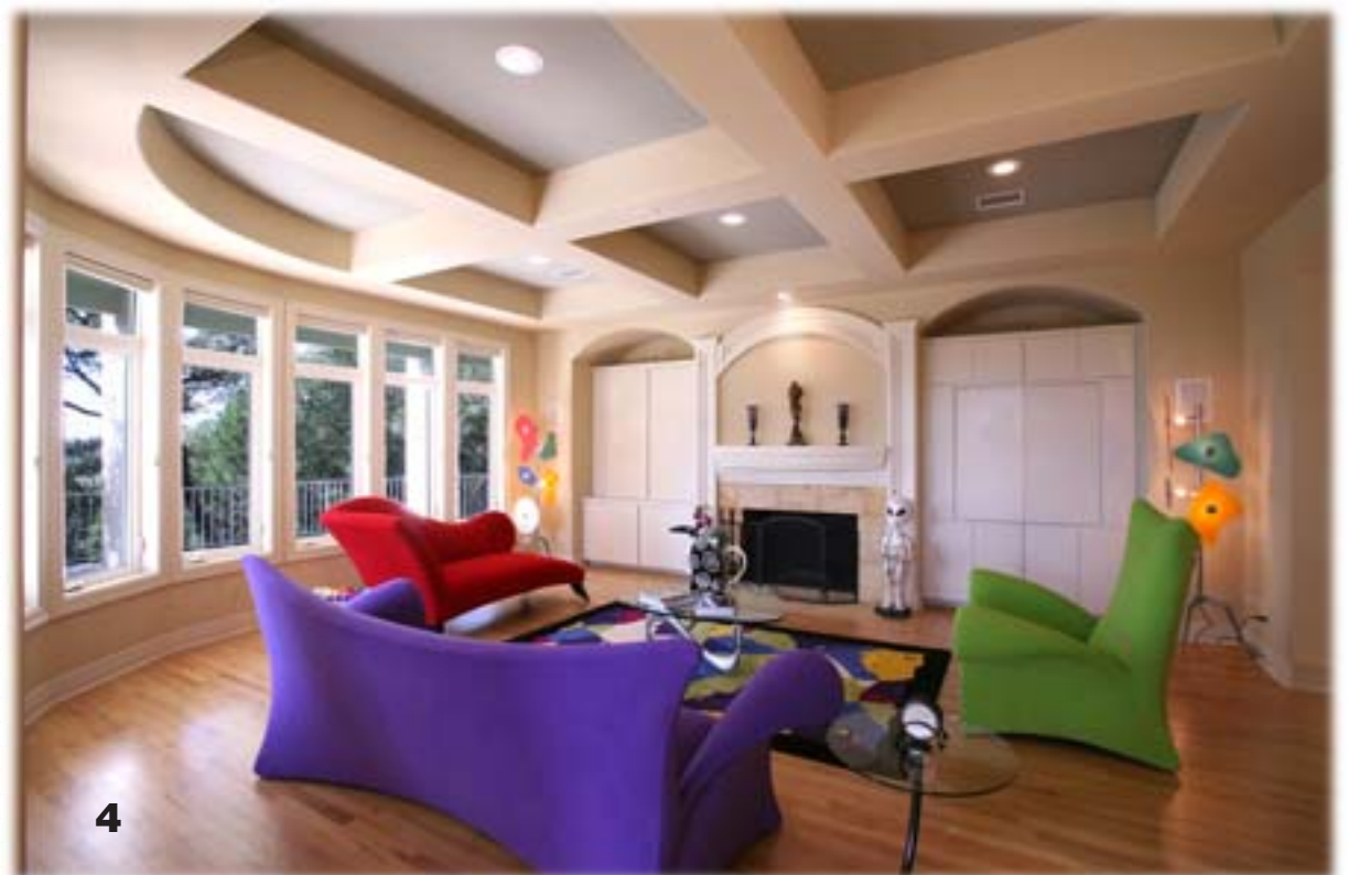
1. Secluded setting—home is on a double lot and surrounded by protected wilderness terrain 2. Kitchen includes a butler's pantry and office niche. 3. View of dining room with dome-shaped ceiling. 4. View of the main living area