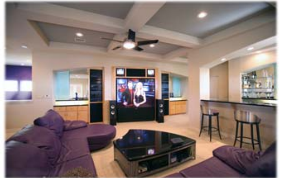
TOP: View of the guest house with pool just steps away. BOTTOM: Upstairs home theater in the main house.

erty? All of this information is on the web at www.stanbarron.com (plus there are additional photographs of the pool, kitchen, living areas and yard areas).